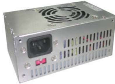
Dimension ( W x L x H ) : 82 x 140 x 56 mm